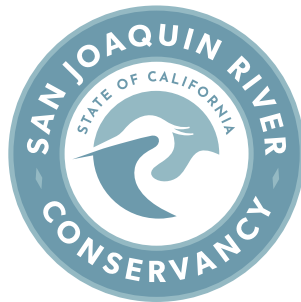
BADGE LOGO For Marketing, Outreach, and Communications Uses