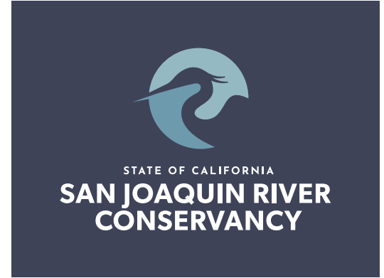
REVERSED LOGO For Dark Backgrounds