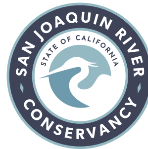
BADGE LOGO For Employees Only