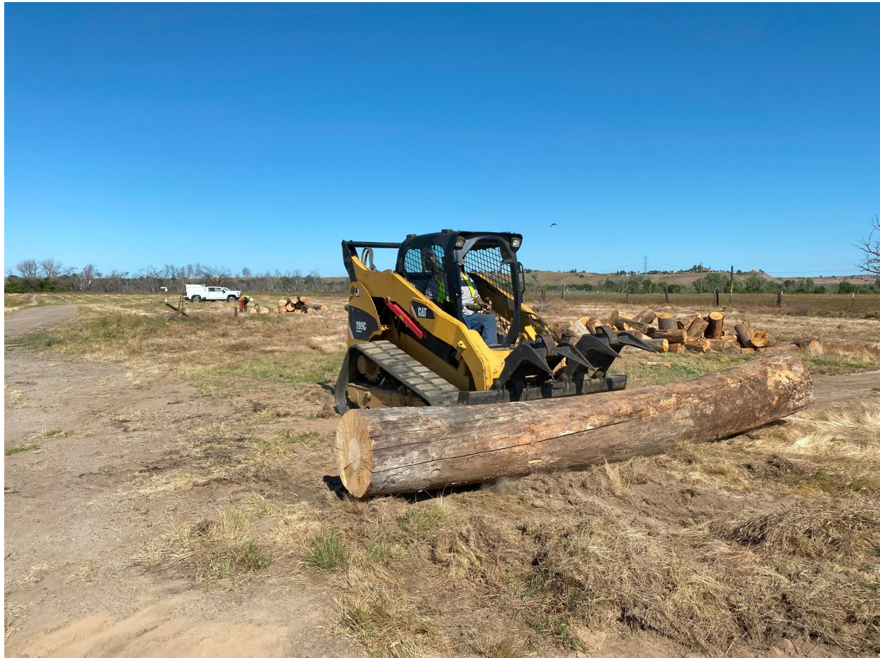
Figure 2: Placing the first barrier log after logs had begun to be removed from the deck and trimmed to size.