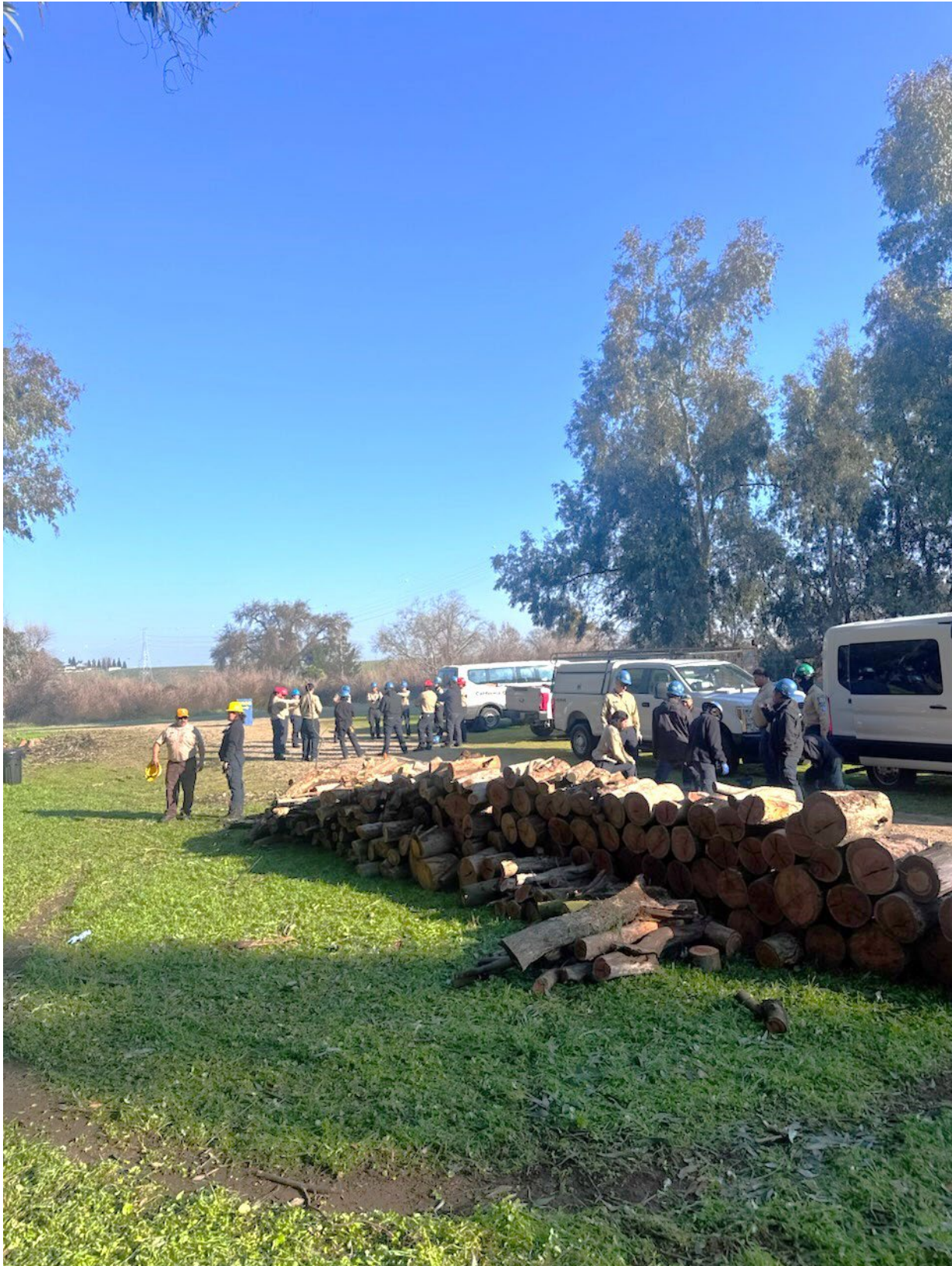
Figure 2: CCC crews preparing for the day's work behind their stack of bucked eucalyptus logs.